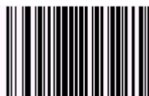
VOYAGER ID: 5