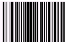
VOYAGER ID: 2